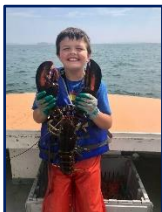
A Day in the Life of a Maine Lobsterman https://www.youtube.com/watch?v=hYWnXjTgaa0 (6:44 min.)