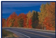
Peak Season in Washington County, Downeast Maine (4:13 min.) https://www.youtube.com/watch?v=SpjB8t_xApo

Mainers are independent people, and we are proud of our state. From the Wilderness of northern and western Maine, to the rocky shoreline Downeast, to the cities of southern Maine, we work hard and value our neighbors and communities. Maine is unique in its diverse lands, industry, and people.