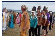
Peskotomuhkat: The Passamaquoddy People – People of the Dawn – History, Culture & Affiliations https://www.youtube.com/watch?v=USkQ_YoBRho (26:26 min.)