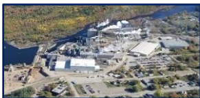
St Croix Tissue, Baileyville, Maine (3:03 min.)

https://www.youtube.com/watch?v=OM9GydYPfRM