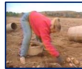
Seeds They Sow: The Potato Harvest in Maine (4:23 min.) https://www.youtube.com/watch?v=Q3r6gWV-zQI