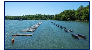
How Aquaculture Drives Maine’s Economy (1:58 min) https://www.youtube.com/watch?v=zyDGj7uw9u8