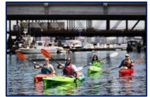
One Week at a Time (from Maine to New York City on inland waterways) https://www.youtube.com/watch?v=bEyrIRtTEZE (11:17 min.)