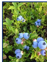
Maine’s Wild Blueberries, Washington County, Maine (9:07 min.) https://www.youtube.com/watch?v=cPvmAzlz-8

https://www.youtube.com/watch?v=OM9GydYPfRM