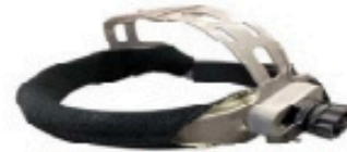
5 Point Adjustable Head Gear