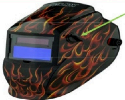
Shade Control 9-13 Plus Grind